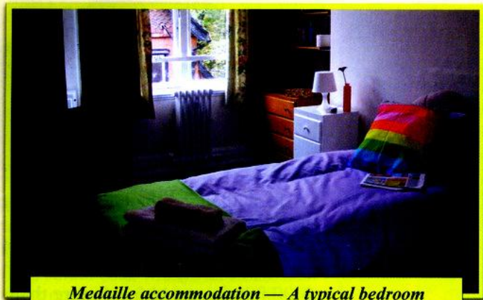
Medaille accommodation — A typical bedroom